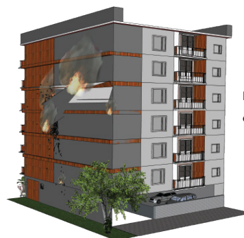
Example of ignited combustible cladding on apartment building